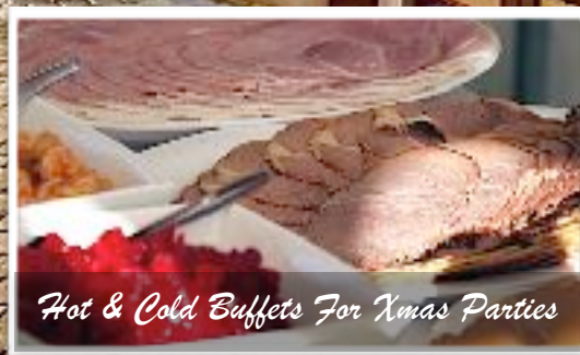
Hot & Cold Buffets For Xmas Parties