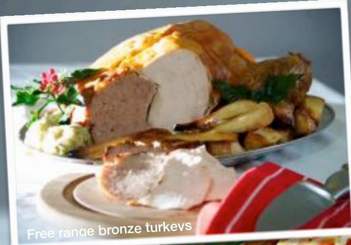
Free range bronze turkeys