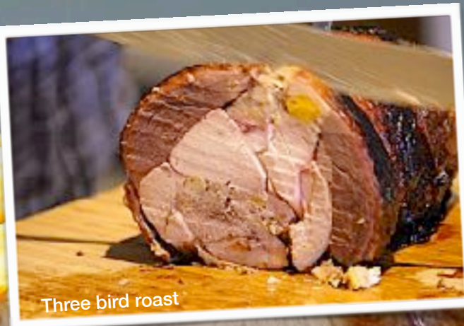
Three bird roast